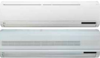
Heat Pump Inverter White 24,000-36,000 BTUs