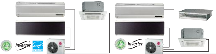
Tri-Zone Flex Multi-Split System Mix and match for 27,000-33,000 BTUs Heat Pump Inverter