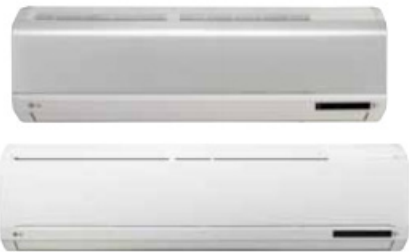
Mini-Split Standard Indoor Unit White 9,000-18,000 BTUs