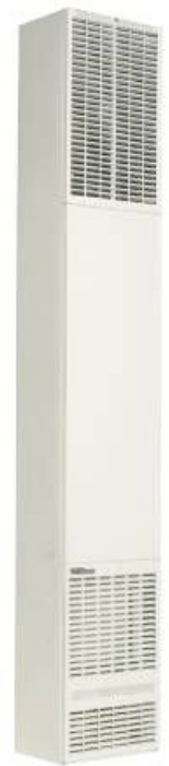
PRICES SUBJECT TO CHANGE