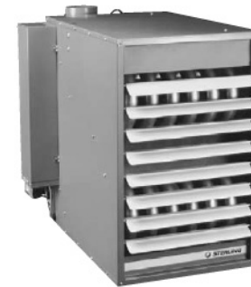
Model "TF" (150-400 MBH) TF150 shown

The Sterling model "TF" is the commercial line of energy efficient gas-fired unit heaters. The "TF" is a propeller type unit heater that combines the latest tubular heat exchanger and inshot burner technology with the quality and reliability you have come to know with Sterling. Available in unit sizes from 150 – 400 MBH.