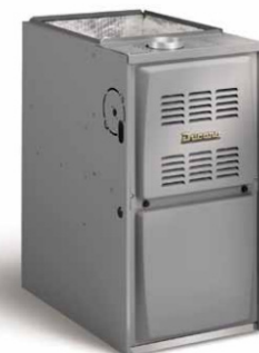
PRICES SUBJECT TO CHANGE